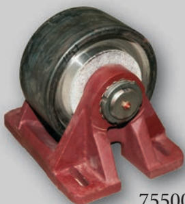
755000 Roller Assembly

Con-Tech Warehouses and Stocks Both OEM, and Many "Will Fit" MTM Parts. From Hoppers to Hydraulics, Call Our Parts Sales Team Today!