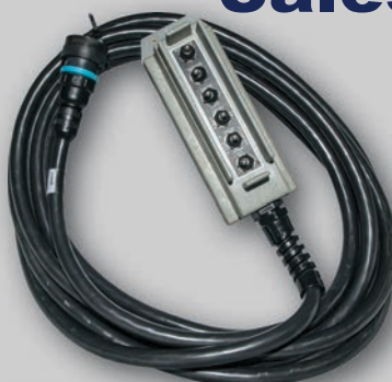
715525 Con-Tech 25' Pendant