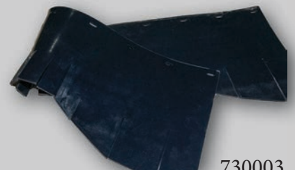
730003 Replacement Poly Bib