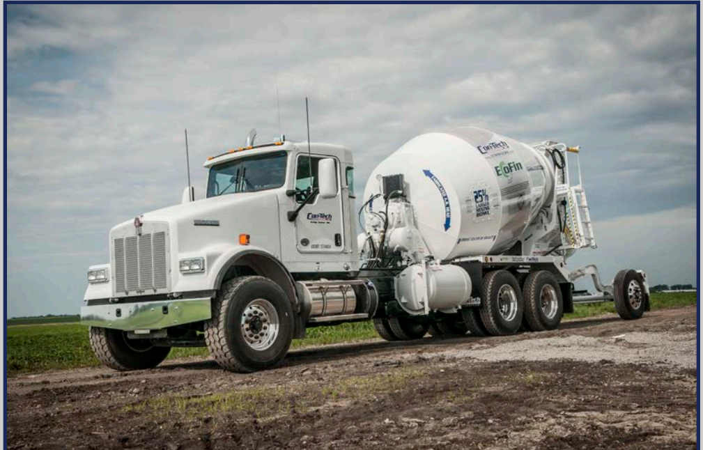
2016 Kenworth W900 Western Package