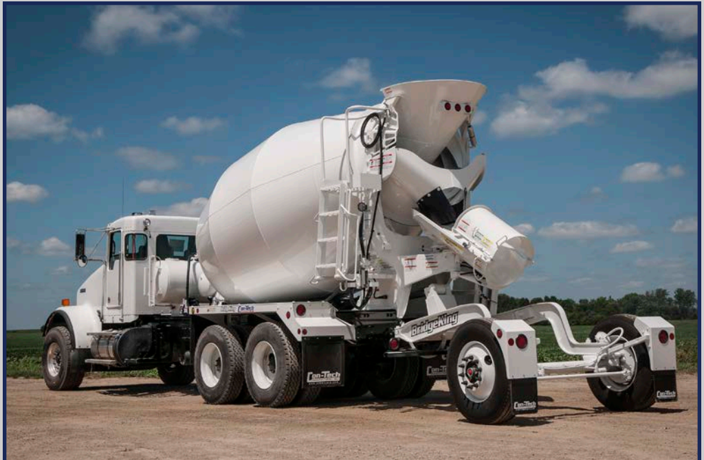
Kenworth W900 BridgeKing

Call and Request a Parts Book. Its full of OEM and "Will Fit" MTM Parts. 507-374-2239