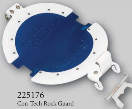
225176 Con-Tech Rock Guard

Con-Tech Warehouses and Stocks Both OEM, and Many "Will Fit" MTM Parts. From Hoppers to Hydraulics, Call Our Parts Sales Team Today!